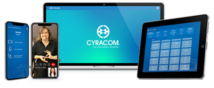
ACCESS CYRACOM INTERPRETERS VIA DESKTOP, TABLET, OR SMARTPHONE VIA THE INTERPRETER APP.